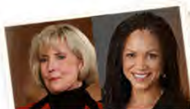
Lilly Ledbetter and Melissa Harris-Perry will be joining us at convention.

Download the mail-in registration form »